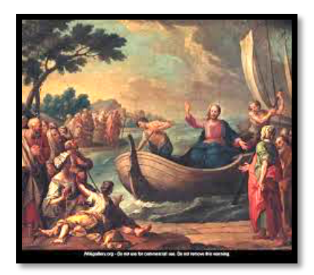
Scripture Readings: Isaiah 55:10-11; Psalm 65:10-14: Romans 8:18-23; Matthew 13:1-23

"The seed sown among thorns is the one who hears the word but then the cares of the world and the lure of riches choke the word and it bears no fruit." (Matthew 13:22) Does the lure of riches and material goods choke God out of your life? Are you so caught up in earthly activities that you have no time for God? Gratitude and generosity are virtues that we should strive to do on a daily basis. Every decision we make either takes us one step closer to God or one step further away. What we receive at Mass every Sunday should be shared with others all the other days of the week as well.