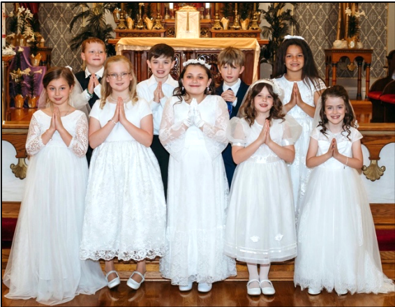
Congratulations to our First Holy Communion Class!

We have received a rough draft of the directory. We are in the process of making corrections.