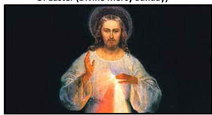
Scripture Readings: Acts 4:32-35; Psalm 118:2-24 1 John 5: 1-6; John 20:19-31

"The community of believers was of one heart and mind, and no one claimed that any of his possessions was his own..." - Acts 4:32