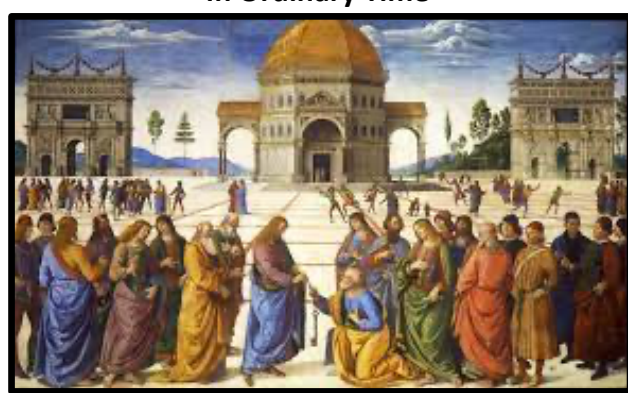
Scripture Readings: Isaiah 22:19-23; Psalm 138 Romans 11:33-36; Matthew 16:13-20

"Or who has given the Lord anything that he may be repaid?" - Romans 11:35