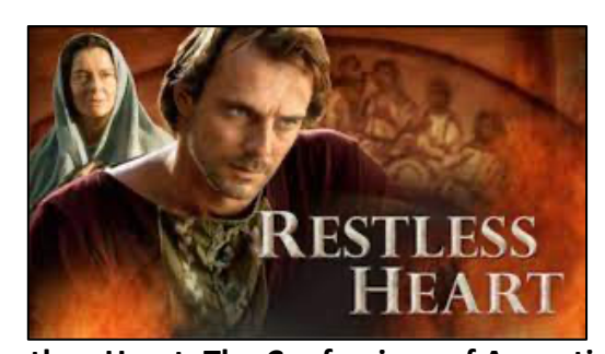
FORMED - The Catholic Faith. On Demand.