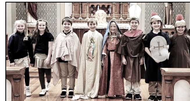
Our 3 rd Graders performed a beautiful production of a Juan Diego and Our Lady of Guadalupe play on December 9 th .