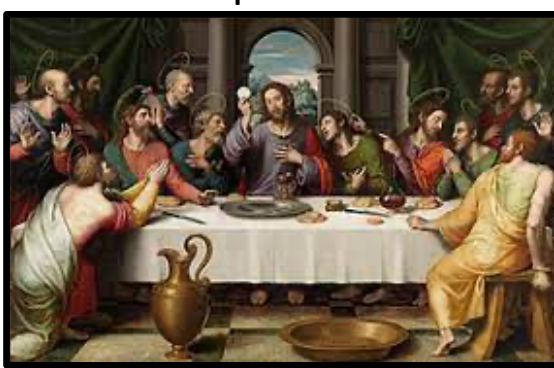
Scripture Readings: Deuteronomy 8:2-16; Psalm 147 1 Corinthians 10:16-17; John 6:51-58

"Because there is one bread, we, who are many, are one body, for we all partake of the one bread." 1 CORINTHIANS 10:17