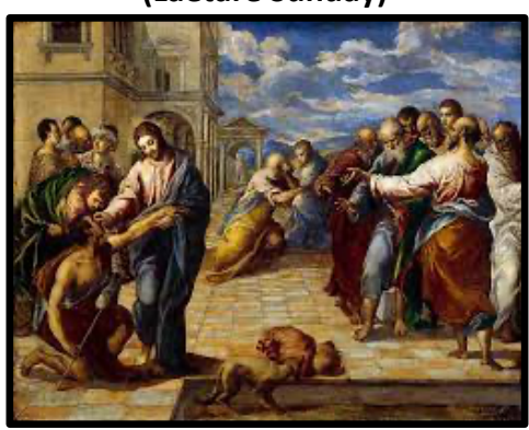
Scripture Readings: 1 Samuel 16:1-13; Psalm 23 Ephesians 5:8-14; John 9:1-41

"Not as man sees does God see, because man sees the appearance, but the Lord looks into the heart."