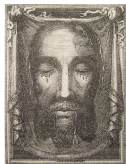
Praise to the Holy Face of Jesus!