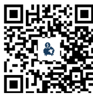
Powered by Flocknote

Thank you for your generosity! To give safely and easily, please visit saintjamescatholicchurc3.flocknote.com/ give or scan the QR code to securely donate from your phone! You may set up automatic recurring giving there as well.