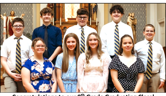
Congratulations to our 8th Grade Graduating Class!

Please pray for vocations to the priesthood.