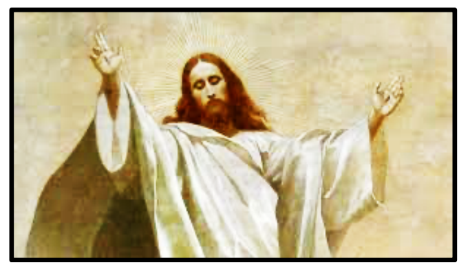
Scripture Readings: Acts 1:1-11; Psalm 47 Ephesians 1:17-23; Matthew 28:16-20

Prayer is the foundation of our Faith and the foundation of Stewardship. Prayer is always the first best option in any situation - not just our last resort. Pray for friends and family, and especially for those that don't treat you very well. Pray to give praise, to thank, and to ask God for help. Pray to see what God wants you to do with the gifts He has given you. Teach others how to pray. It has been said that teaching someone how to pray is the best gift you can give someone.