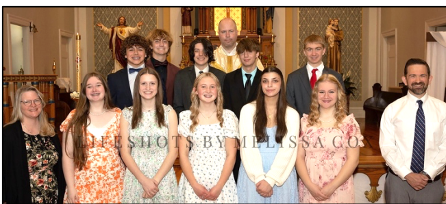
Congratulations to our St. James School 8<sup>th</sup> Grade Graduates!

A-M, bring a side dish. N-Z, bring a dessert. Members are encouraged to bring a prospective recruit.