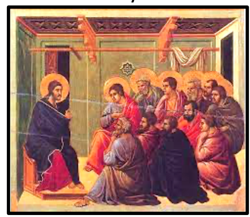
Scripture Readings: Acts 6:1-7; Psalm 33 1 Peter 2:4-9; John 14:1-12

"The stone which the builders rejected has become the cornerstone." 1 PETER 2:7